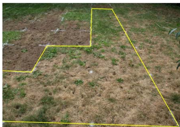
Figure 2. Turf loss in untreated areas outside the treated plots (yellow outline). Some of the decline of turf in treated plots was presumed to be due to these stresses.

Phytotoxicity – canopy reflectance. Canopy reflectance, which can be correlated with photosynthetic activity and plant health, showed a similar pattern to the visual phytotoxicity ratings (Table 3). There was a rate effect apparent in the experimental treatments, with higher rates producing a larger decline. Since the canopy reflectance readings integrate reflectance from both grass and weed foliage in the plots and there was a loss of grass in the plots generally, it is likely that much of the decline in NDVI values