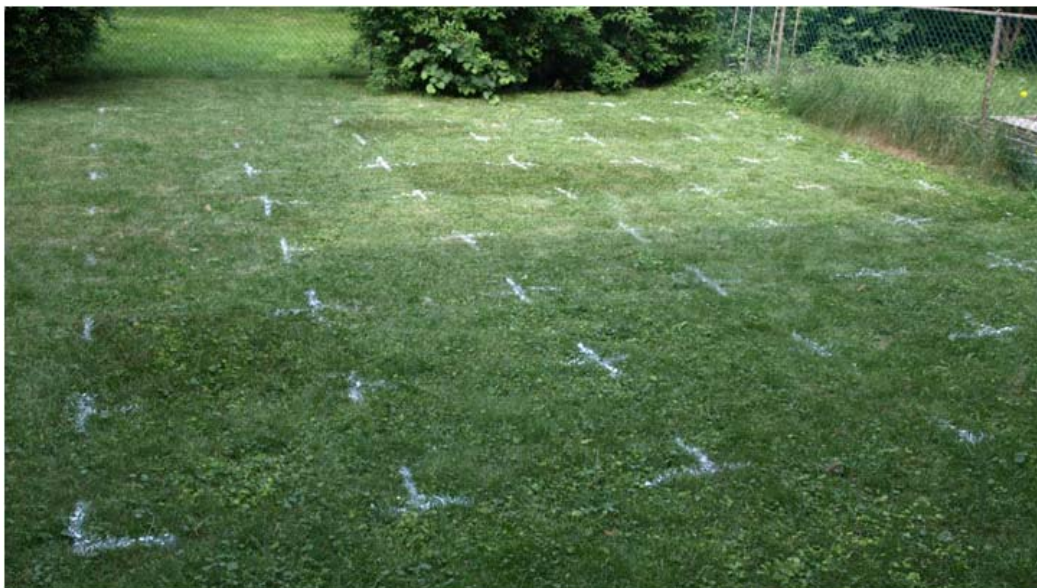
Figure 1. Plot area on June 18, 2011. Forty-eight 1x1 m plots were laid out, and the 36 plots with the heaviest infestation of creeping charlie were included in the experimental design.